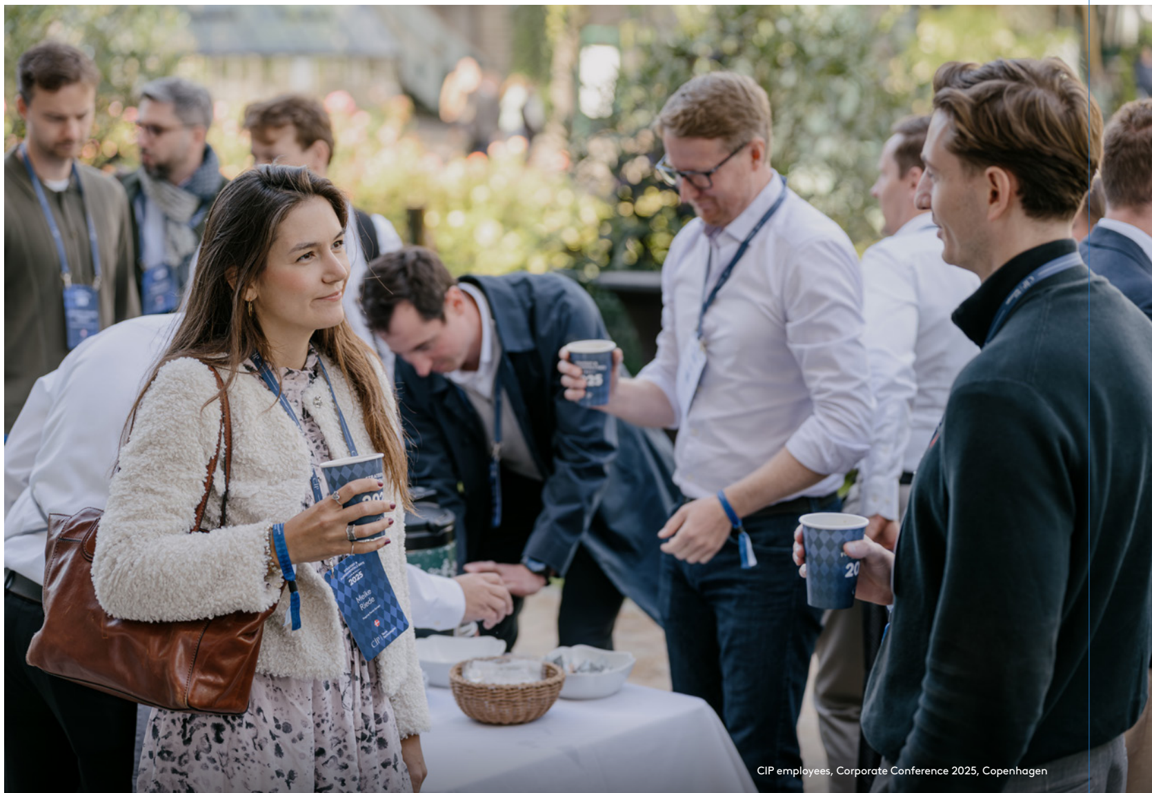
CIP employees, Corporate Conference 2025, Copenhagen

CIP leverages data for various purposes, for the benefit of CIP, its investors, and its employees. We are committed to upholding ethical data practices, ensuring human dignity, equality, fairness, and responsible data use. By actively considering data ethics, we aim to minimise risks such as algorithmic bias, lack of transparency, and accountability issues. CIP implements appropriate organisational and technical security measures to ensure safe and secure data usage. We periodically review our policies, incorporating feedback from employees and partners, and staying updated with trends, technology, and legislation.