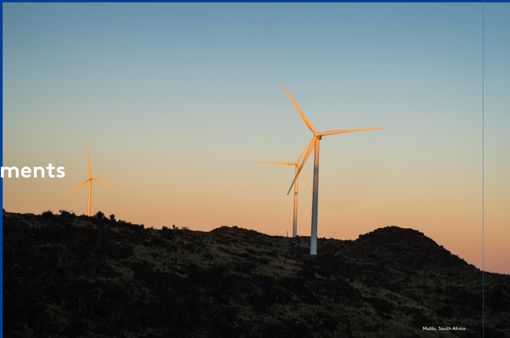
Mulilo, South Africa