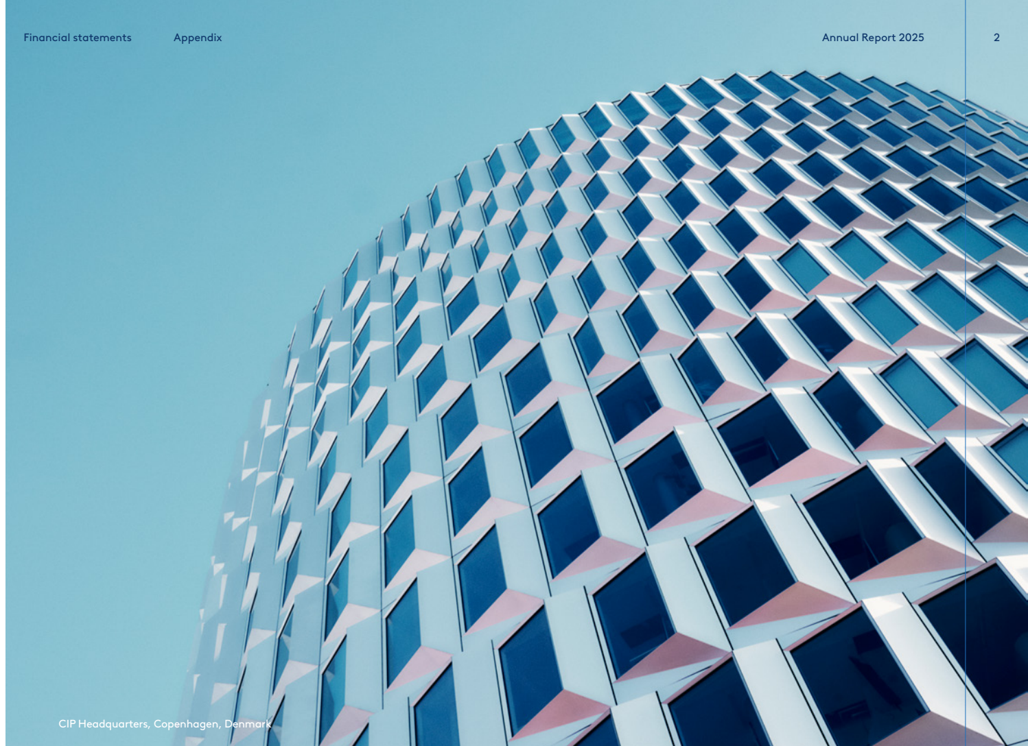
CIP Headquarters, Copenhagen, Denmark

Copenhagen Infrastructure Partners P/S Gdanskgade 18, 12, 2150 Nordhavn