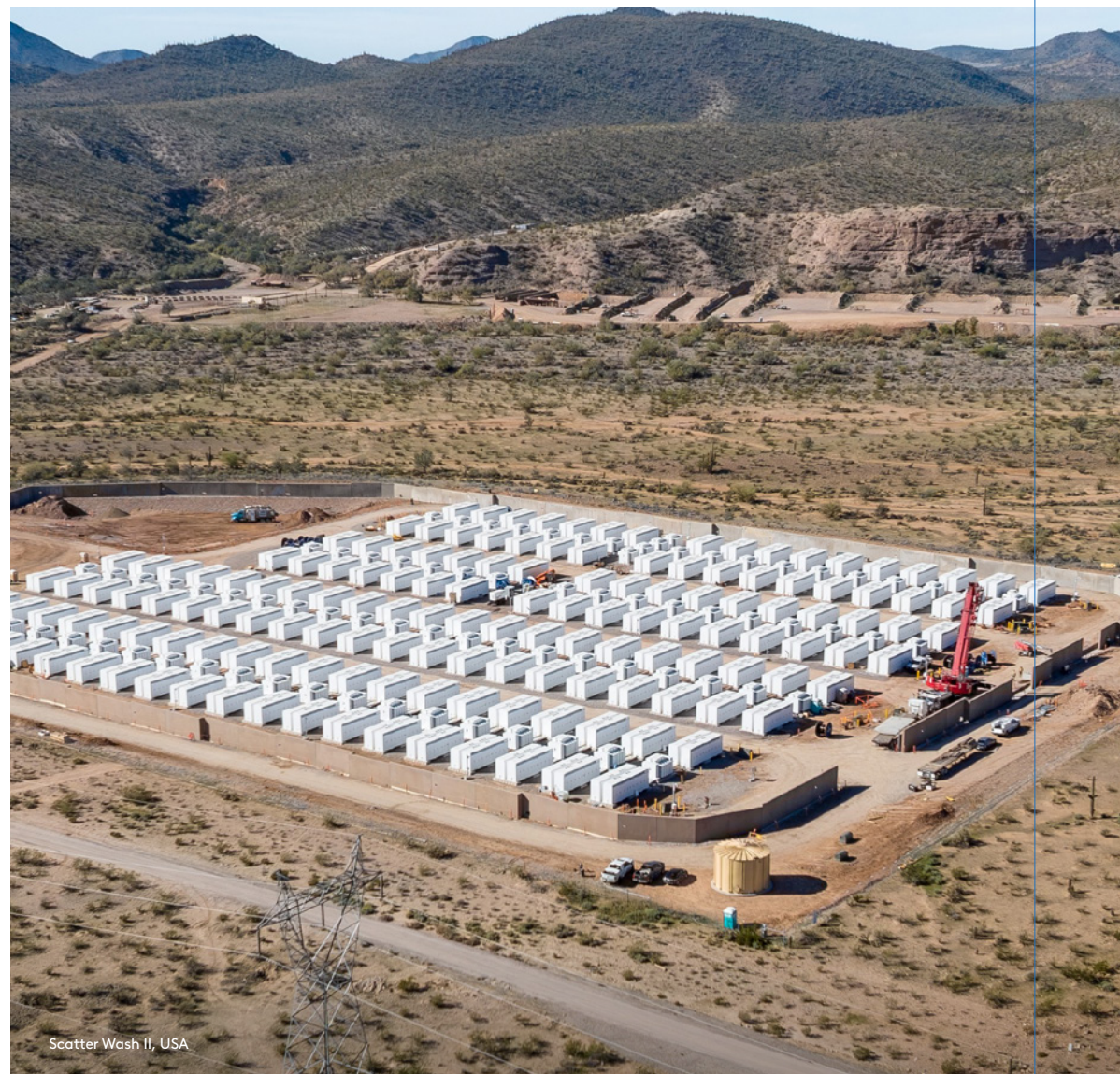
Scatter Wash II, USA